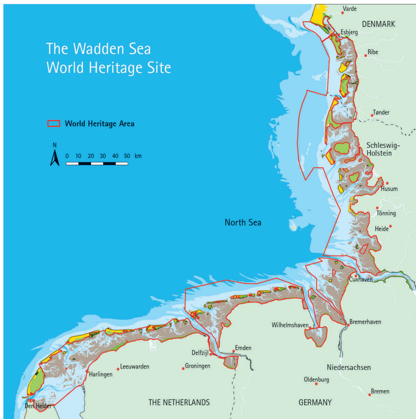
Figure 3. Map of the Wadden Sea World Heritage Site (Image: CWSS).

(Figure 3). It covers an area of 11,456 km 2 along a coastal strip of approximately 500 km. The Wadden Sea has had the status of a protected area for more than 20 years: by a Nature and Wildlife Reserve in Denmark, by National Parks in Germany and by Nature Reserves in the Netherlands. The designation as a World Heritage site has no immediate influence on the protection status of the area nor does it cause any new regulations.