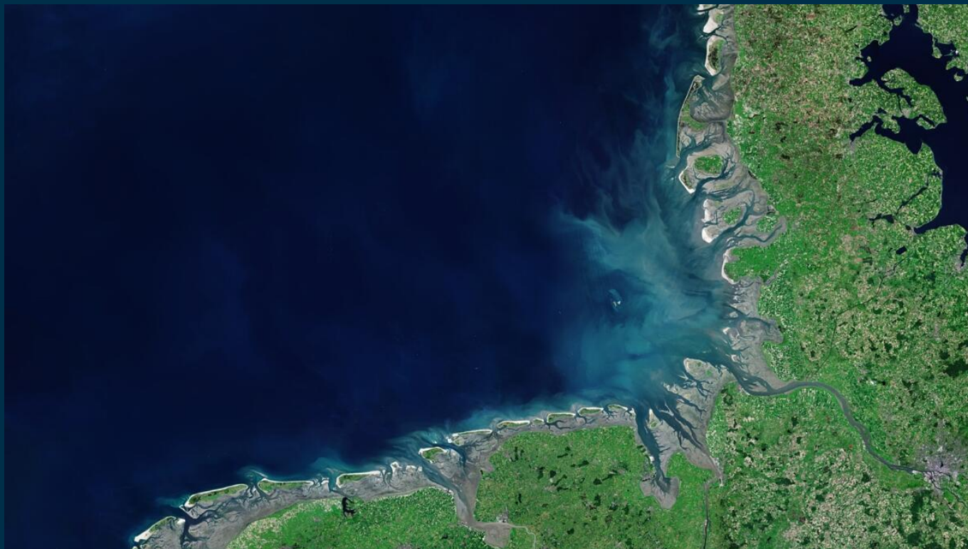
Satellite image of the Wadden Sea.